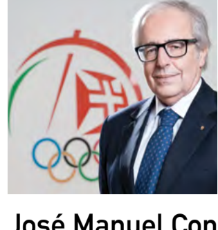
José Manuel Constantino (President, NOC Portugal)

The postponement of the 2020 Olympic Games has just been announced. Do you agree or disagree with such decision, and the way it was handled by sport and political authorities?